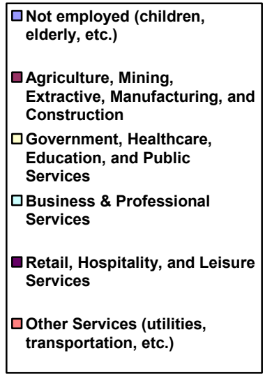
Table 3: US Population and Employment by Segments

The knowledge-intensity of many segments is growing as government, industry and universities invest to develop the workforce of the future. Even many sales jobs require a certain degree of technical skill in a knowledge-intensive service economy.